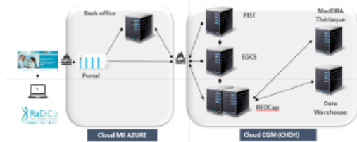
Cloud Microsoft AZURE; CHDI: Certified Health Data Host; CGM: CompuGroup Medical; Portal: Users authentication & selected access to the cohorts; Back Office: Management of access rights; PST: Patient Identification System Translator; REDCap: Research Electronic Data Capture; EGCS: Electronic data capture Gateway; Controller Service; MedDRA: Medical Dictionary for Regulatory Activities; Thélosque: Drugs databank