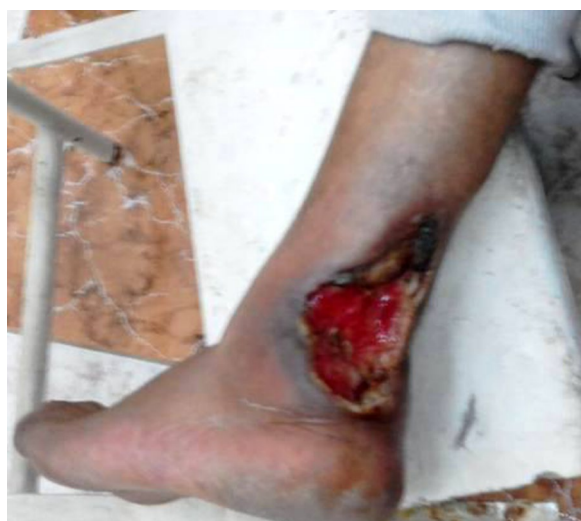
Fig. 1 Extended ulcerative lesion with raised necrotic borders deforming upper part of left foot heel in an Algerian diabetic patient infected by L. major

Most unusual and atypical clinical aspects of Leishmania infection are reported in immunodeficient patients [11]. Patients with advanced age, long history of