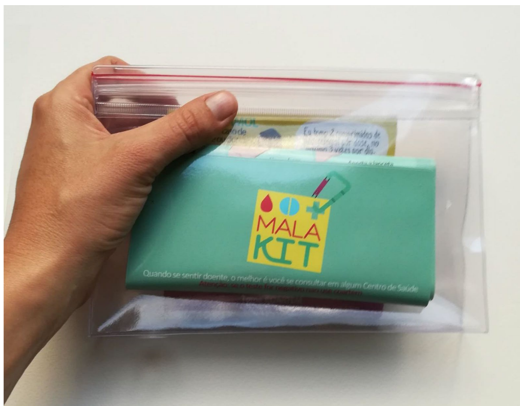
Fig. 2 Self-diagnosis self-treatment kits

potential interactions with cardiac treatments, and the insufficiency of drug absorption in case of vomiting. In those cases, participants will be invited to start the treatment and rapidly consult at a health centre. The clinical signs have been defined by the Malakit scientific committee in a way that should easily be recognizable by participants. Women will be informed that in case of pregnancy, they should not take primaquine, and that a medical consultation is recommended.