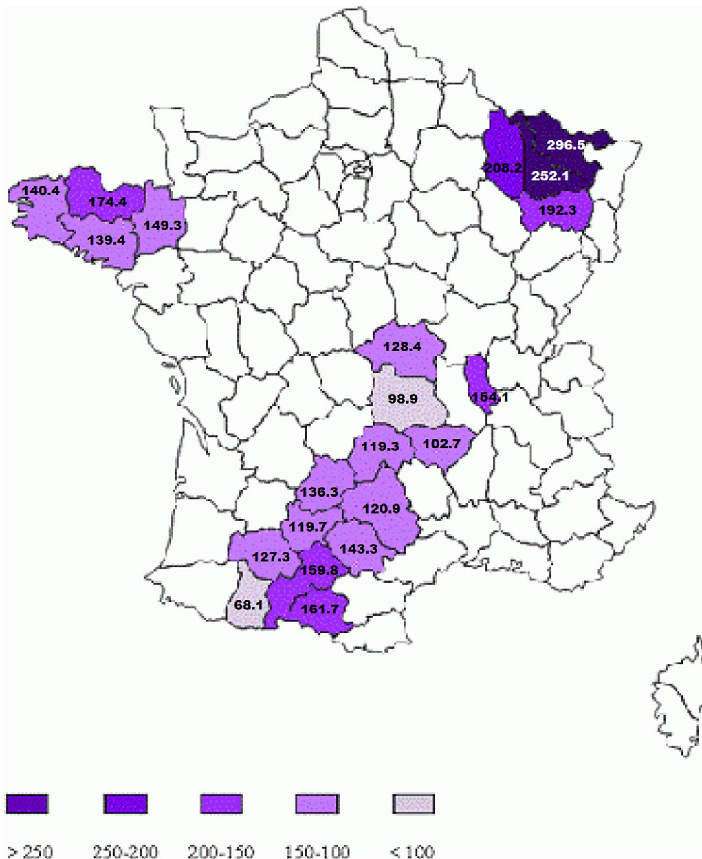
Fig 2. Standardized MS prevalence per 100,000 inhabitants for the 21 departments under study.