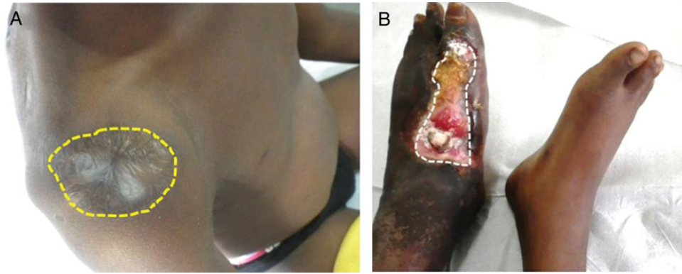
Figure 3. Typical group 2 clinical form (old spontaneously healed Buruli ulcer and an active lesion [n = 13]). The patient presented (A) a stellate scar on the upper part of the right arm, 8 cm in diameter (B) a typical active Mycobacterium ulcerans ulcerative lesion on the left foot, measuring approximately 10 × 5 cm. The lesion had undermined edges and was painless. Mycobacterium ulcerans infection was confirmed by polymerase chain reaction and acid-fast bacilli on tissue extracted from this lesion. The yellow dotted line circumscribes the scar area with a stellate appearance (edema). The white dotted line circumscribes the active lesion (ulceration).

suggests that the immune response involved in healing cannot sterilize the tissue, or even confer protection against M. ulcerans . Therefore, the development of a vaccine against M. ulcerans may be compromised. It seems unlikely that the occurrence of a second lesion is due to a second contamination event involving the inoculation of the skin with the bacillus. Given the high rate of osteomyelitis observed in second lesions, it seems more likely that M. ulcerans disseminates systemically, as suggested by other studies [14, 16, 19, 24].