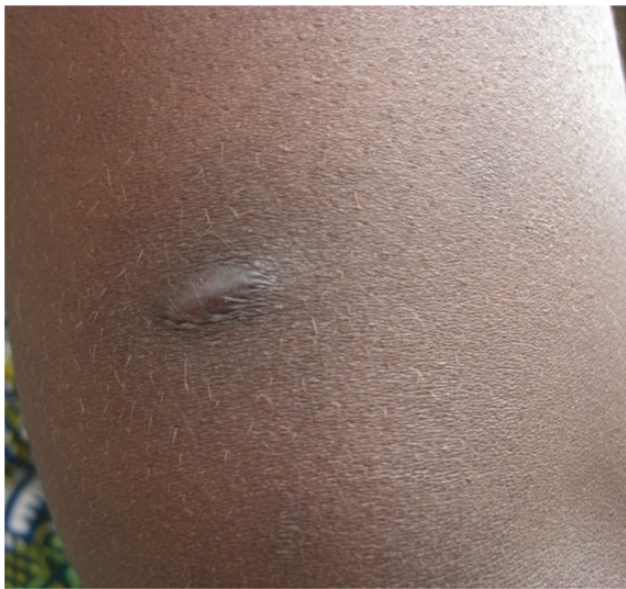
Figure 4. Complete spontaneous healing of a Mycobacterium ulcerans lesion. Scar resulting from the spontaneous complete healing of a nodule in a woman who received no treatment.

The single patient in group 3 provides a formal demonstration of the possibility of spontaneous healing of Buruli ulcer without the intervention of Western or traditional medicine.