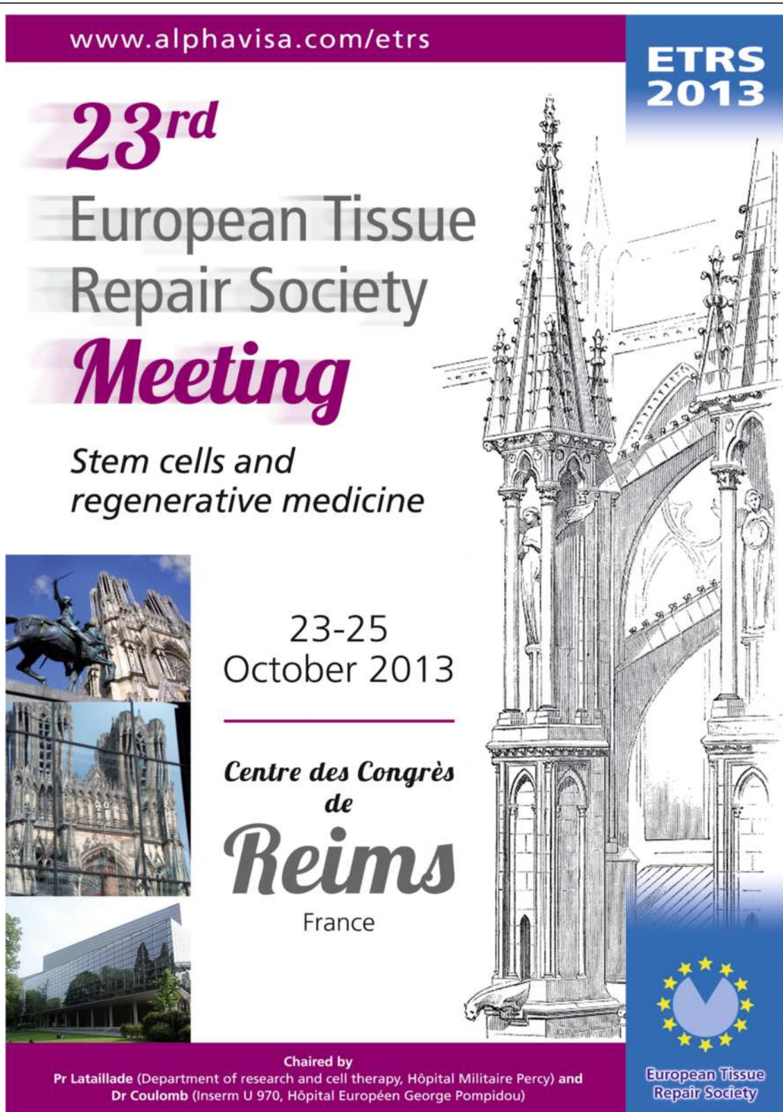
Figure 1 Flyer of the 23 rd Annual Meeting of the European Tissue Repair Society.