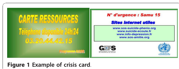
Figure 1 Example of crisis card.

Telephone contact will be abandoned, if unsuccessful after at least 3 call attempts on 3 different days at 3 different daytimes, and sending “postcards” will be scheduled for the next 5 months.