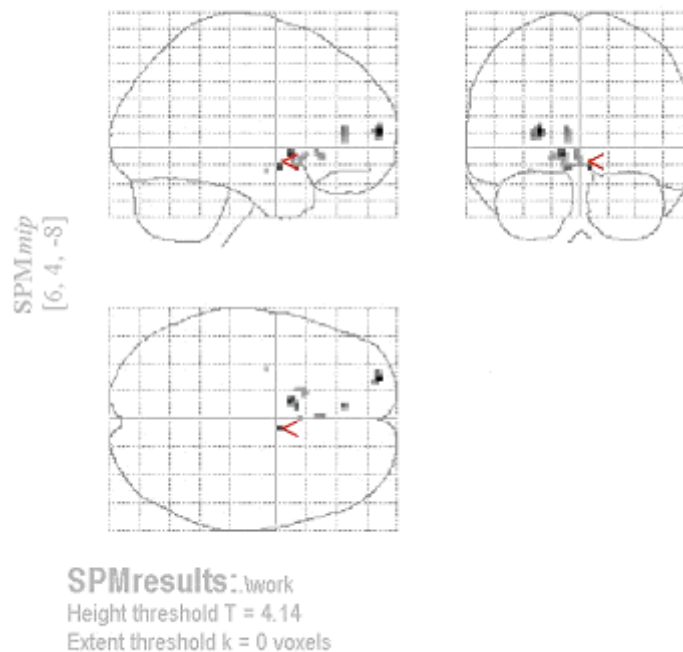
Figure 1: Statistical map of cerebral perfusion (“brain glass”) comparing treatment-resistant depressed patients (n=6) with healthy volunteers (n=6) ( p value=0,001).

We detected significant differences in the activity of various brain areas, between the two groups of subjects (chronically depressed and treatment-resistant patients vs. healthy controls). The statistical comparison revealed significantly ( p=0.001 ) hyperperfusion in the depressed patient group compared to the healthy control group (Figure 1). These regions included the bilateral sACC (BA 25), left prefrontal dorsomedian cortex (including BA10), left ACC (BA32) and left subcortical areas: putamen, pallidum and amygdala (Table 1 and Figure 2).