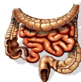
Bowel disease Ulcerative colitis