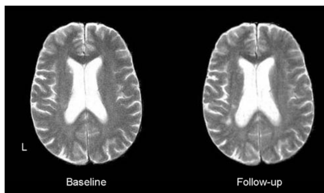
Figure 2. Illustration of the technique used for MRI assessment. On the left side of the Figure, there is an axial T2-weighted image of first MRI examination of a PROGRESS patient. On the right side, the image is taken from the second examination performed at the end of the follow-up. With registration techniques and histogram equalization, it was possible to make this second examination as similar as possible to the first examination, as seen in the Figure, thus facilitating the comparison between the 2 examinations by the neuroradiologist. Despite the small loss of resolution in the second examination due to the technique, it is possible to visualize new lesions close to the left occipital horn.