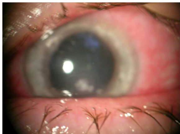
Figure 1 Dolosigranulum pigrum keratitis in patient n1. Central corneal whitish infiltrate at patient's initial presentation.

simplex virus (based on the 18S rDNA, rpoB and DNA polymerase genes, respectively) were negative. Ten days after initial examination, the corneal scraping however tested positive for 16S rDNA in the presence of negative controls and sequencing the 16S rDNA PCR product yielded 982/990 bases (99%) and 881/881 bases (100%) sequence similarity with the homologous sequence of D. pigrum reference strain (GenBank X70907) and with D. pigrum clone 6113702 (GenBank EF517957.1) and only 93% with the following identified species Alloiococcus otitis .