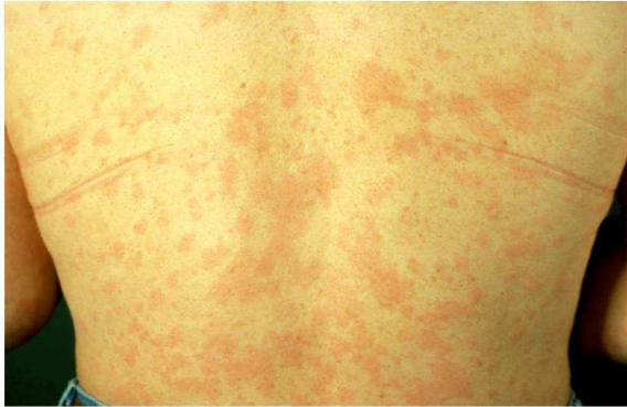
Figure 1 the typical rash of the Schnitzler syndrome, which corresponds to a neutrophilic urticarial dermatosis: rose to red macules and/or slightly raised plaques. The lesions are usually not itchy and vanish within hours without sequel.